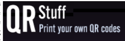
CREATE YOUR OWN QR CODES FOR YOUR BUSINESS.