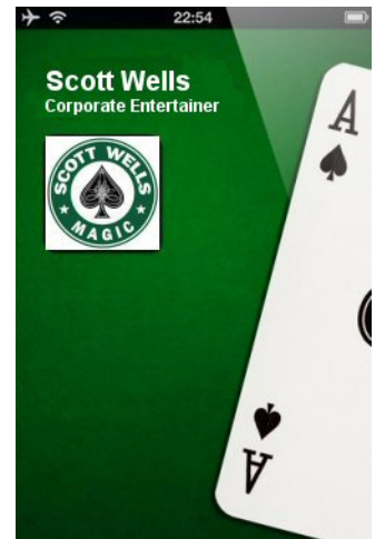
THE SCOTT WELLS APP LOOKS LIKE THIS ON YOUR IPHONE